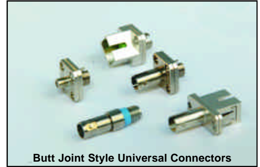
Butt Joint Style Universal Connectors

Please note that universal connectors will not couple light efficiently from a multimode fiber into a singlemode fiber. High losses are unavoidable in this situation, since multimode fibers have both larger numerical apertures and larger core sizes.