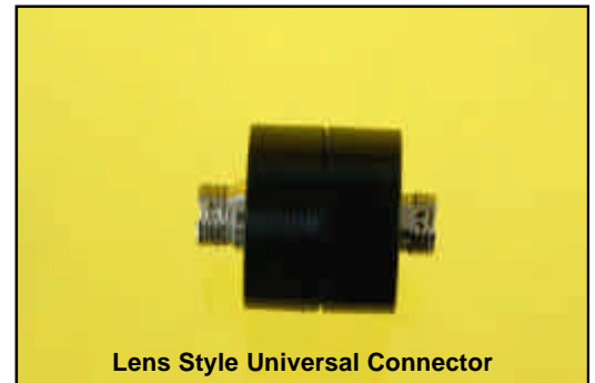
Lens Style Universal Connector